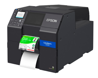
CW-C6000P 4" Peel-and-present

Epson offers the first color inkjet printer with peel-and-present capability, which can help speed up the manual application of on-demand labels. An integrated label-taking sensor holds off subsequent printing until the previous label is removed. This feature is ideally suited for fully automated label application systems. This unique capability eliminates the need for a loose loop and allows individual labels to be taken as soon as they are printed.