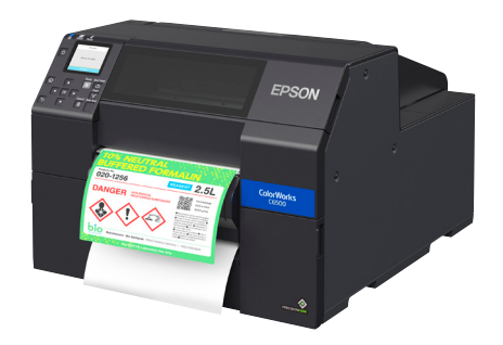
CW-C6500P 8" Peel-and-present