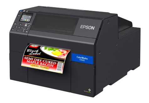
CW-C6500A 8" Auto Cutter