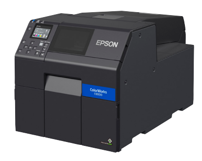
CW-C6000A 4" Auto Cutter

With a 4" or 8" built-in auto cutter covering the full spectrum of label sizes to create variable-length labels and enable easy job separation, these new ColorWorks models offer cost and inventory reductions compared to using pre-printed labels.